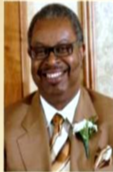
Seventh Region Director 2000 - 2009